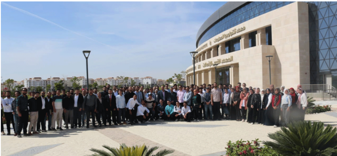
3rd Intake Admission Tests of DEY