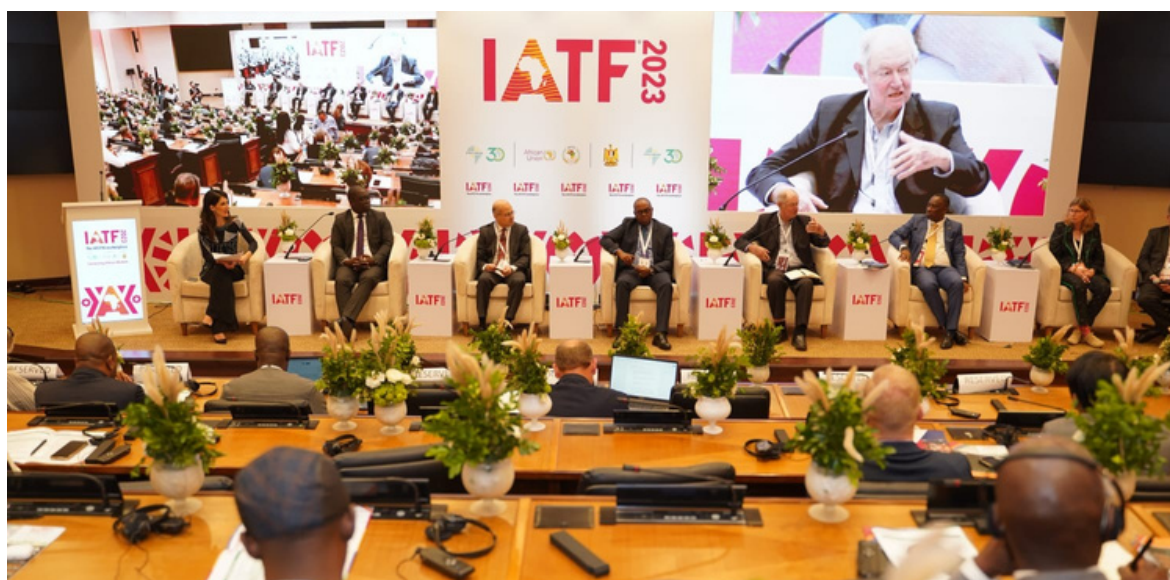
Intra-African Trade Fair Day One Panel Session Photo

The Intra-African Trade Fair (IATF) is a remarkable one week long conference that gathered all continental and global economic players at the Al Manara Conference Centre in Cairo, Egypt. This dynamic event showcased the strength of intra-African trade, featuring a robust participation of 1,650 exhibitors. The IATF's international significance was demonstrated by the presence of representatives from 45 African countries and participants from 60 countries outside Africa. With 61 countries hosting pavilions and a total active participation of 118 countries, IATF 2023 emerged as a crucial platform for fostering economic collaboration. Drawing 28,000 visitors, the event solidified its standing as a premier trade engagement hub. Additionally, the inclusion of four special days of events enriched the overall experience, offering focused discussions and opportunities for strategic networking.