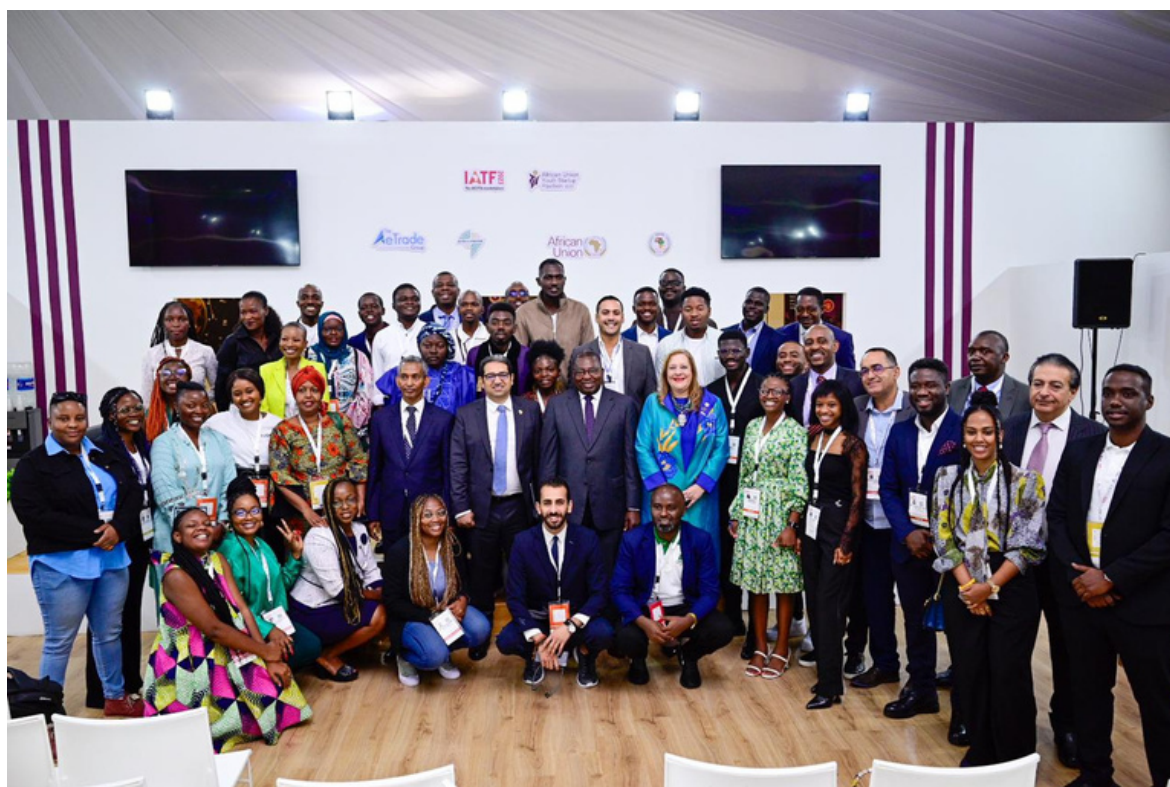
A Group Photo Youth Entrepreneurs with the African Union and the AeTrade Team after the pitching session

III. Fostering market connectivity, intra-African trade, and youth networks while enabling youth voices to shape policies and initiatives, ensuring their active involvement in decision-making processes.