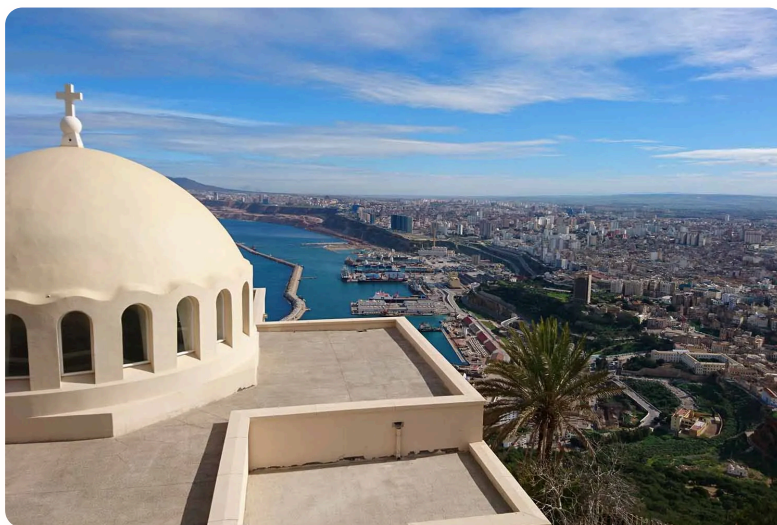
Oran, Algeria – Host City of PAYF 2024 ( Mosaic North Africa )

The ICOYACA Secretariat proudly sponsored the participation of its North Africa members, further reinforcing its commitment to regional inclusion and youth empowerment in Africa's digital era. The event fostered diverse collaboration, critical thinking, and leadership among youth, resonating with the African Union's One Million Next Level initiative .